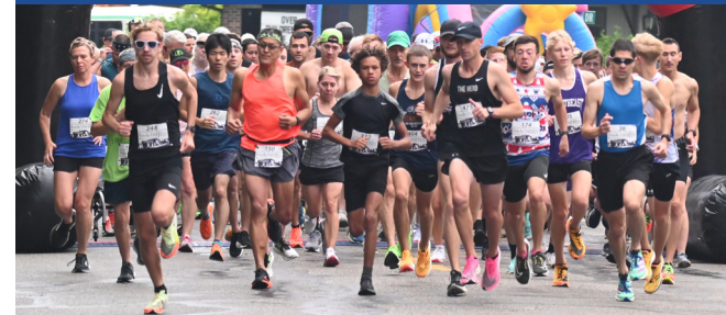
5-Mile & 2-Mile Races & Children's Races (electronically timed) Two-Mile Walk